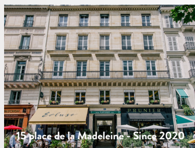
15 place de la Madeleine - Since 2020