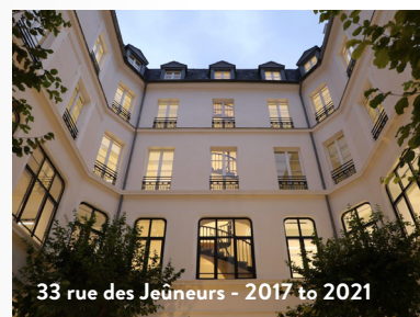
33 rue des Jeûneurs - 2017 to 2021