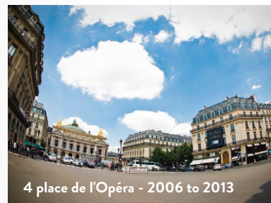
4 place de l'Opéra - 2006 to 2013