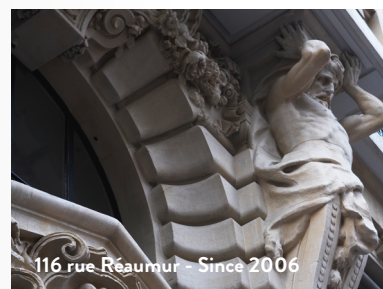
116 rue Réaumur - Since 2006