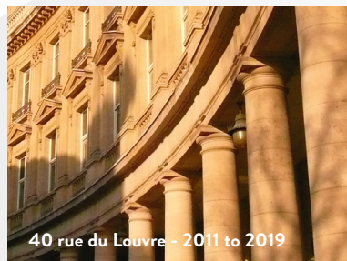
40 rue du Louvre - 2011 to 2019