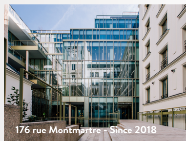
176 rue Montmartre - Since 2018